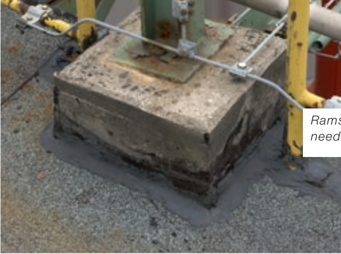
Ramshackle, roof in need of repair.

Damaged seals let moisture penetrate the roof. With disastrous consequences: concrete corrosion, long-term weakening of the structure of the entire building, irreversible damage to valuable interiors. And the formation of mildew, which is expensive to remedy, threatens the health of the occupants. But leaking roofs are not God-given, they are preventable; with Elastocoat.