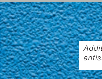
Additional benefit: antiskid surface.

® = registered trademark of Elastogran GmbH